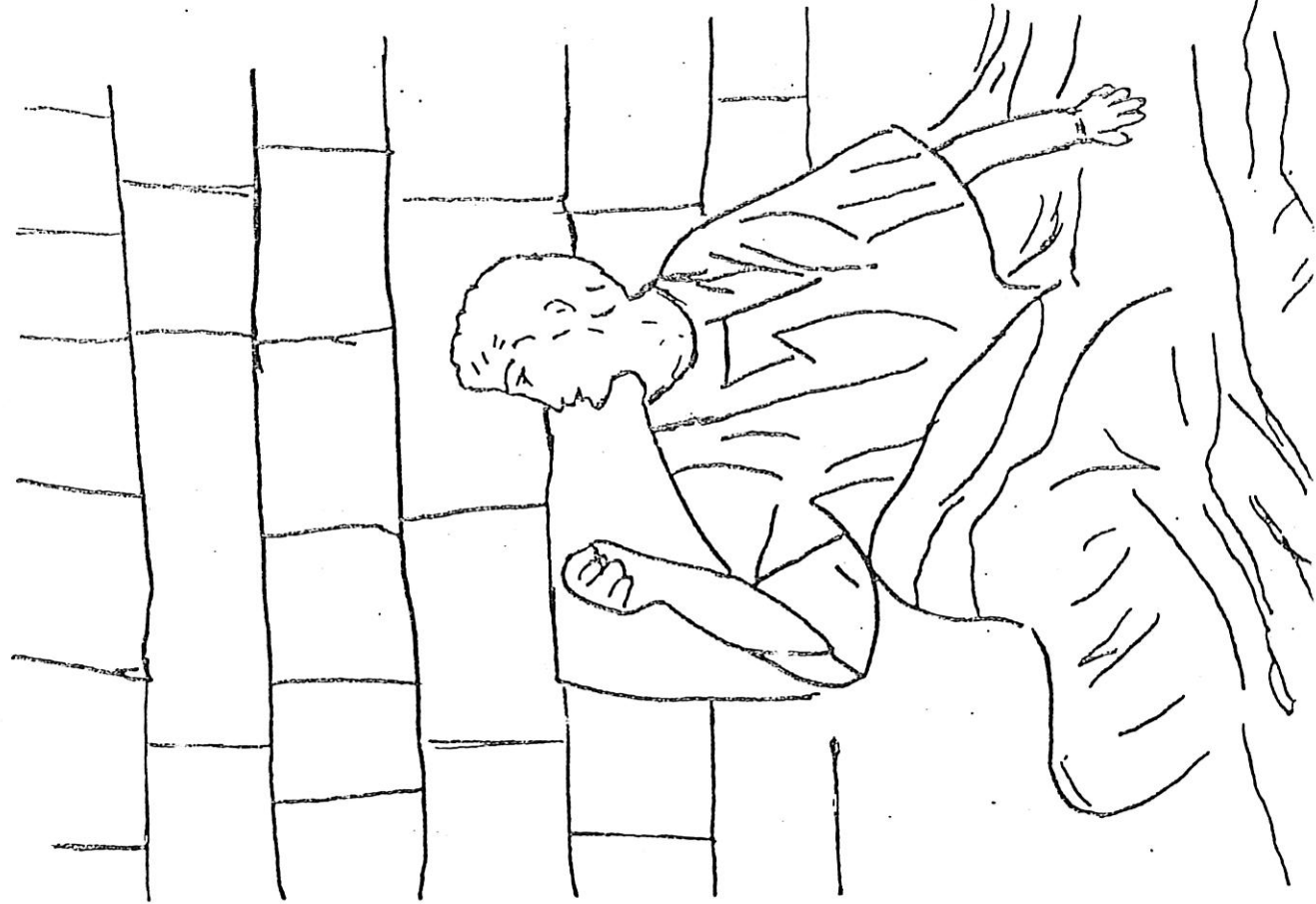
Illustration of Samuel in the temple.