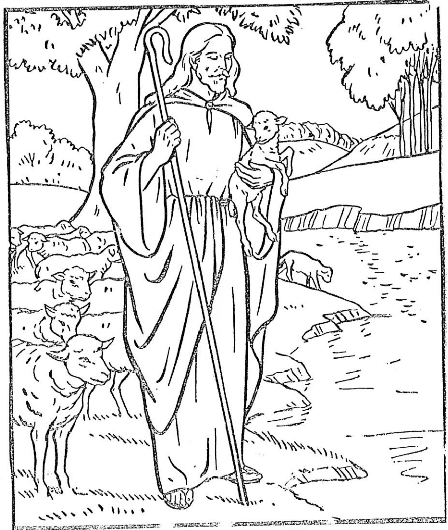
THE GOOD SHEPHERD