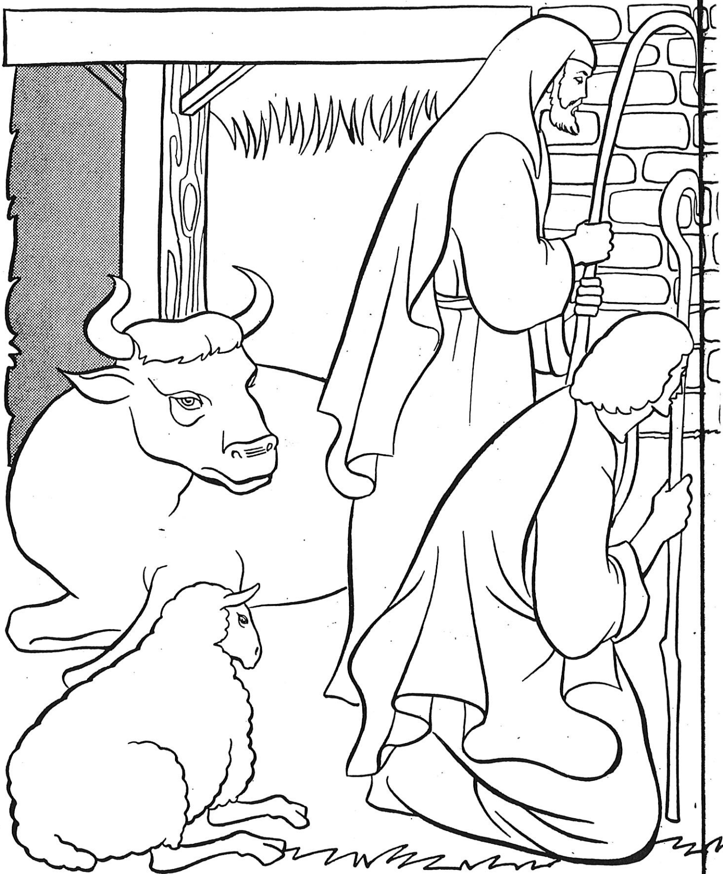
In Bethlehem, Mary and Joseph found lodging in a stable. And here, in a manger, the baby Jesus was born.