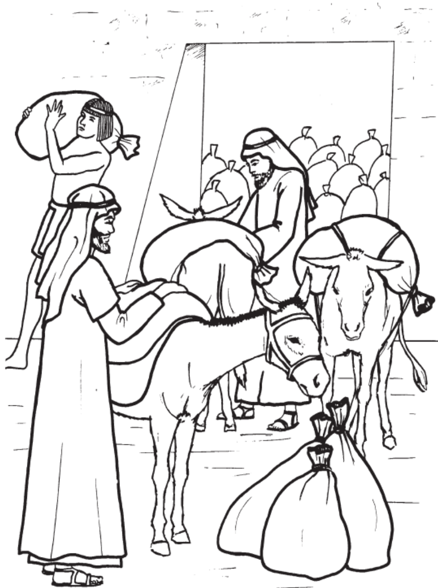
Colour in the picture of Joseph's brothers loading their sacks of corn.