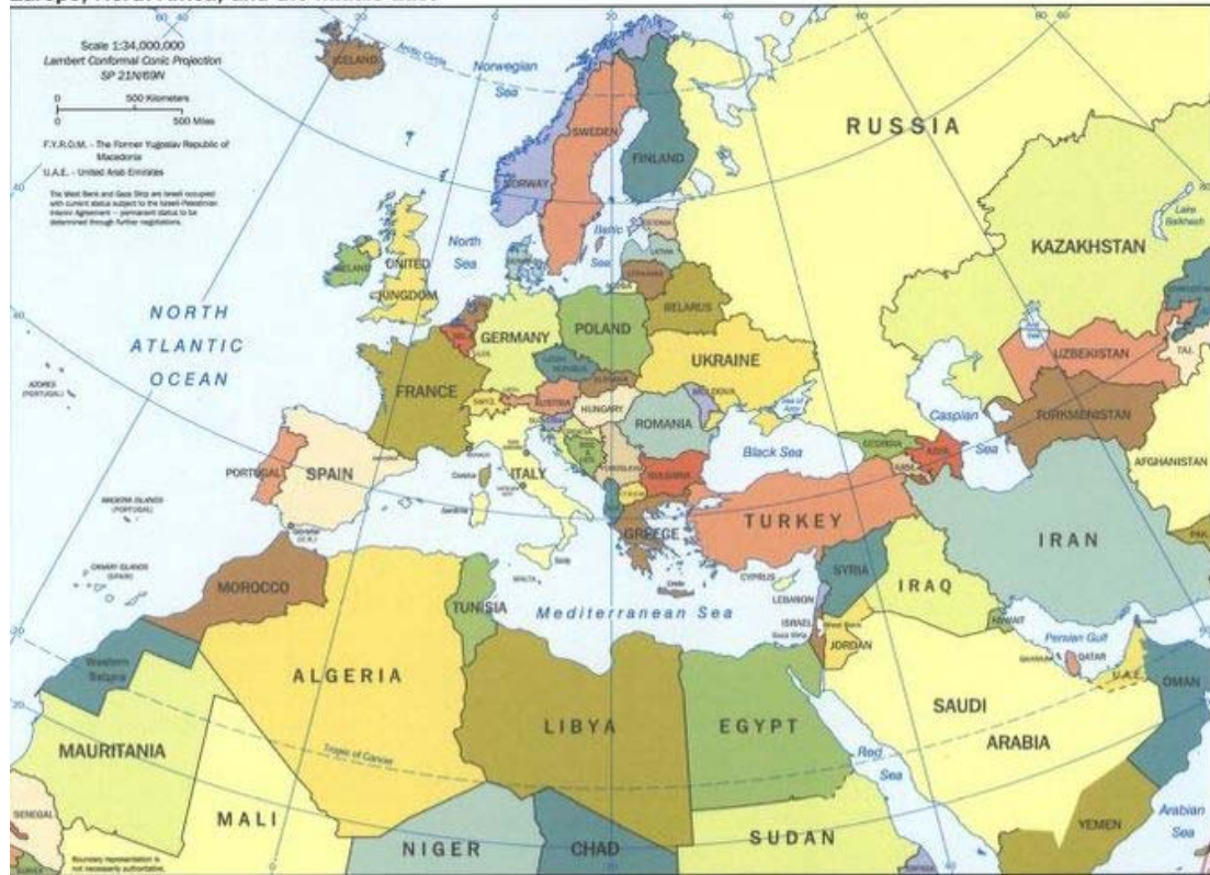
Europe, North Africa, and the Middle East